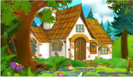
Caring, Learning and Growing